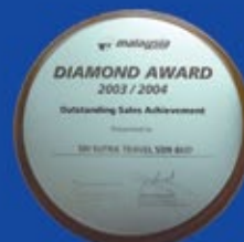
Diamond Award (Malaysia Airlines) 2003/2004