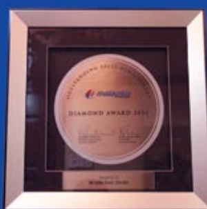
Diamond Award (Malaysia Airlines) 2011