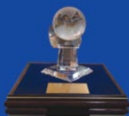
Lazare Club (Malaysia Airlines) 2000/2001