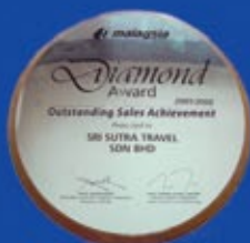
Diamond Award (Malaysia Airlines) 2001/2002